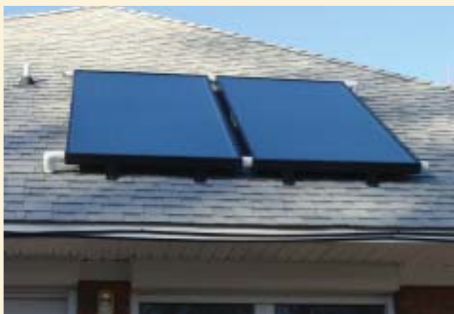
Solar collectors on the roof of a home look just like skylights.