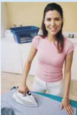
Ironing at a different time may one day be cheaper.

The next generation of appliances, "smart appliances," are supposed to be programmable to a price amount you want to pay for electricity. If the price signal from your meter is over that amount, the appliance will not run. An example being, if you used to run your dishwasher at 6 p.m., it may be a peak price period, and more than you want to pay. Instead, your dishwasher will run when the price falls to the bracket you are willing to pay.