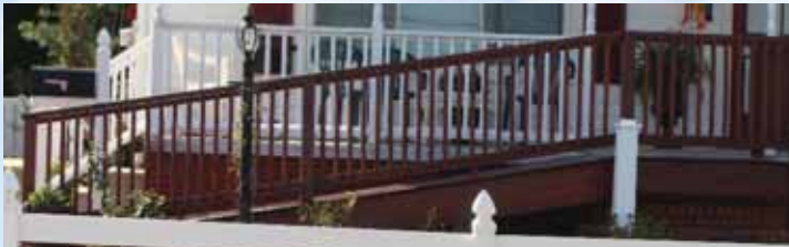
Some veterans only need a ramp attached to a deck or porch, other times, a completely new structure needs to be put in place.

"A lot of veterans don't have families," said Creswell. "And around holidays, such as Christmas and New Year's, we want them to know there is someone here."