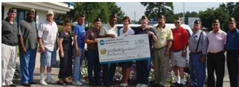
Chapter members were ecstatic about receiving funding to help more veterans.

Visit www.dav.org to locate a chapter near you or to just learn more.