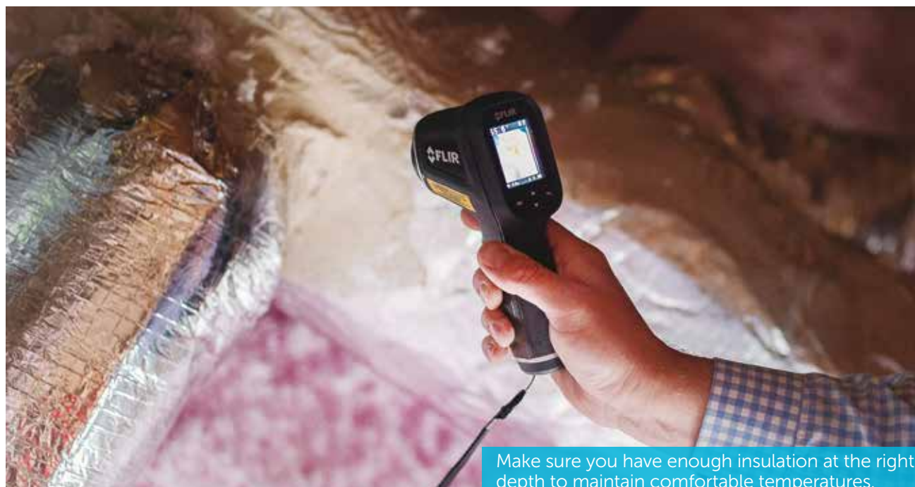
Make sure you have enough insulation at the right depth to maintain comfortable temperatures.

For complete details visit sremc.com or call 910.892.8071 x 2152.