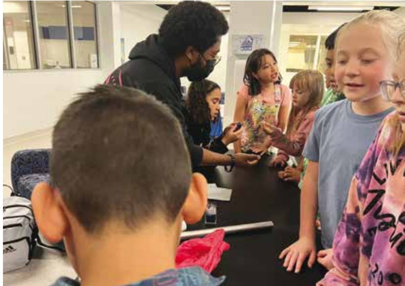
Hargrove Elementary third graders learn about outer space at Fayetteville State.