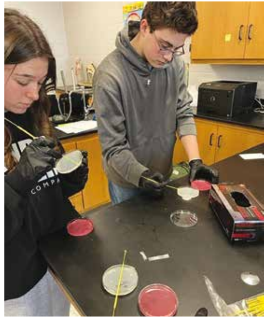
Midway High students studying microbiology.

However, schools have not had the funding in their budgets to provide all the different project ideas, in particular, science.