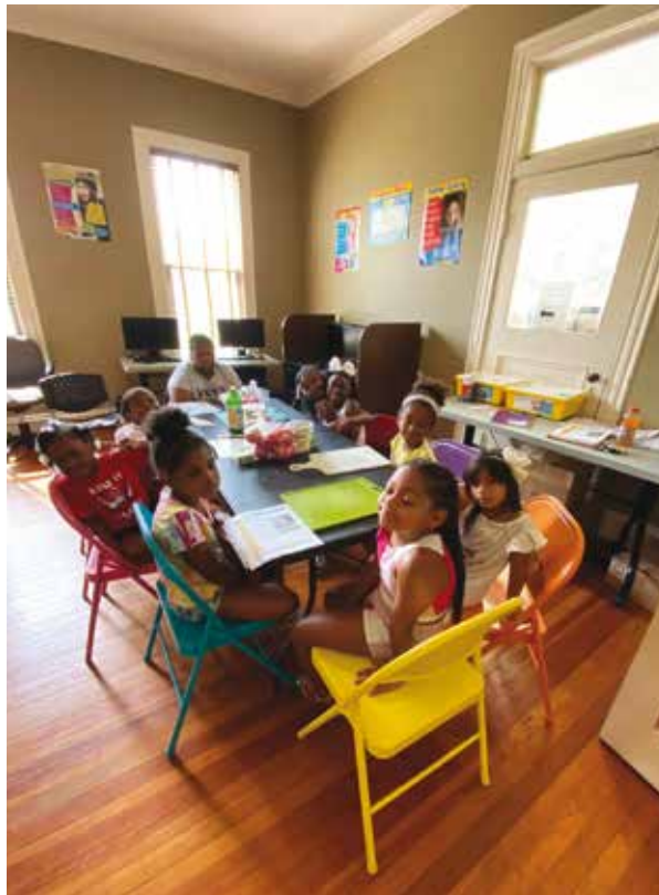
Girls participating in the G.R.E.A.T. program.

"Referrals come from Harnett County Schools,