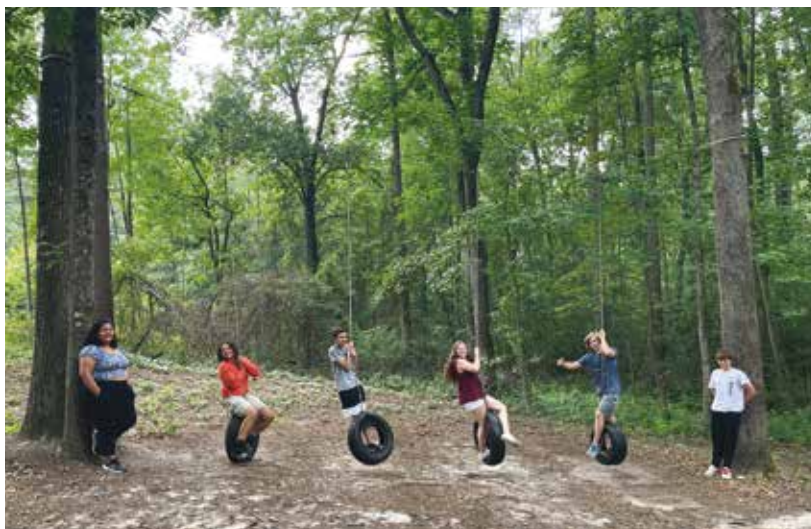
Co-op Leadership Camp Attendees 2023

Students attending are eligible to apply for the $1,000 Jim Graham college scholarship during their senior year of high school.