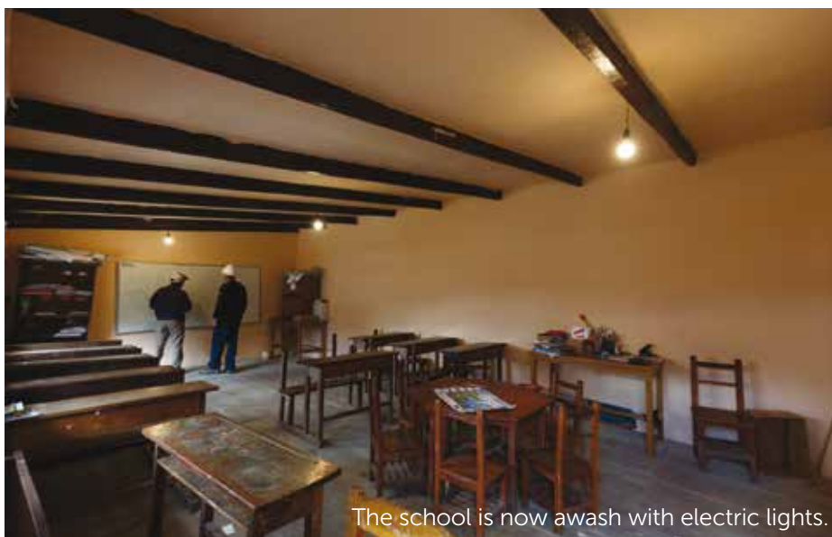
The school is now awash with electric lights.