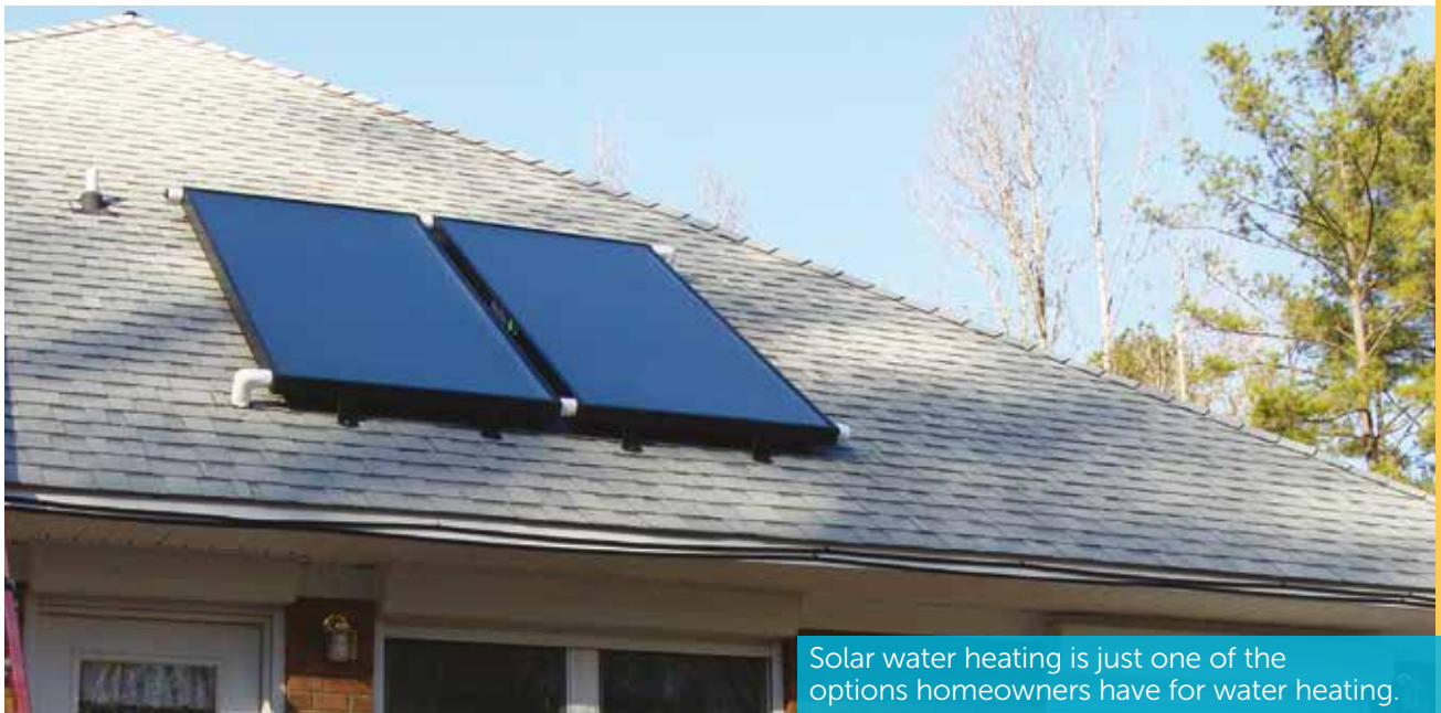
Solar water heating is just one of the options homeowners have for water heating.

South River EMC also offers rebates on solar water heaters, $150, and heat pump water heaters, $200. For details visit sremc.com or call 910.892.8071 x 2152.